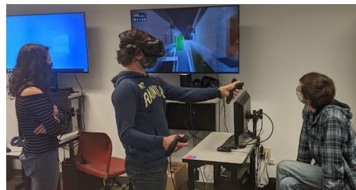
Figure 2: Students using an HTC Vive Eye head-mounted display with their custom-developed software also showing on the screen in the back.

This paper outlines the various display systems and environments available at Wright State University and discusses both the hardware and the software aspects to administer and support these environments in the following sections.