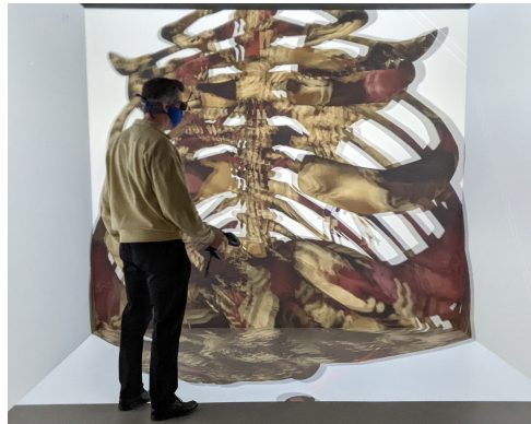
Figure 1: Anatomic visualization in a CAVE-type display system.

Thomas Wischgoll* Wright State University