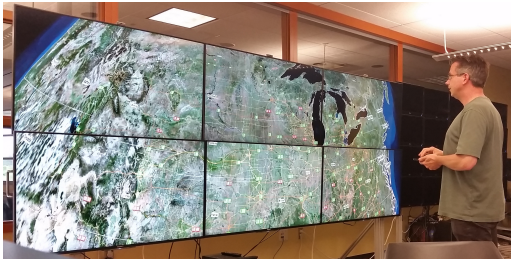
Figure 3: High-resolution tiled display system showing a GIS application based on OpenStreetMap.