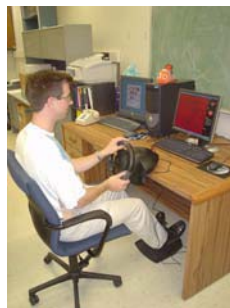
Figure 3: A user in front of the visualization system using Microsoft's SideWinder Force-feedback wheel.