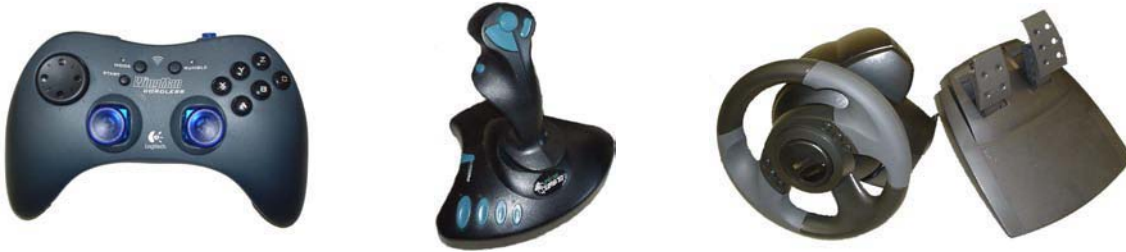
Figure 1: Different input devices supported by the exploration system: Logitech's WingMan Cordless Rumblepad (left), Primax' Raptor 3D joystick (center), and Microsoft's SideWinder force-feedback steering wheel with race car pedals (right).