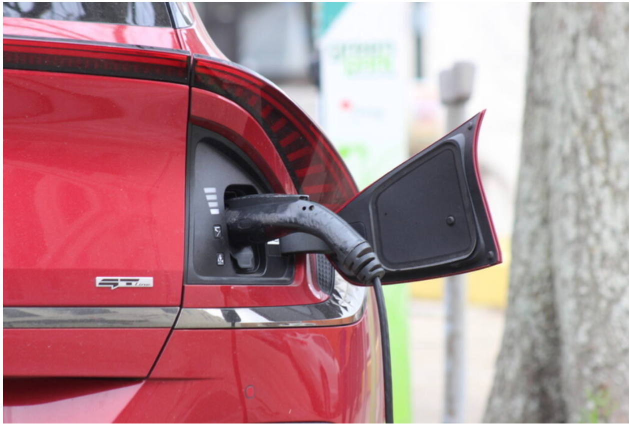
An electric vehicle charges its battery at a public charging station in Baton Rouge on Feb. 24, 2023.