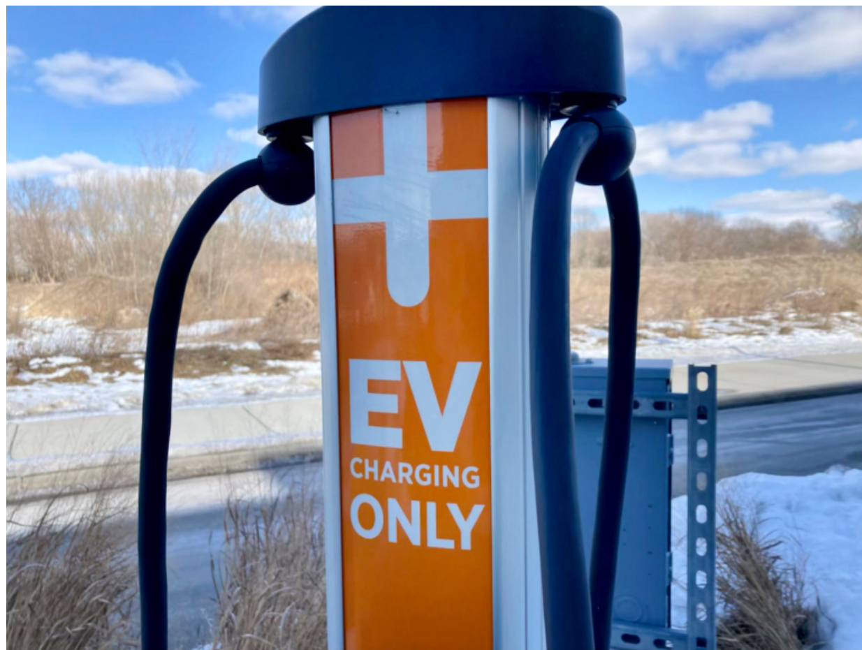
A ChargePoint electric car charging station in a parking lot in Madison, Wis. on Feb. 12, 2022.

But advocates say there is still apprehension among consumers to ditch their gas guzzlers, which they blame in part on disinformation and anti-EV myths pushed by the oil and gas industry.