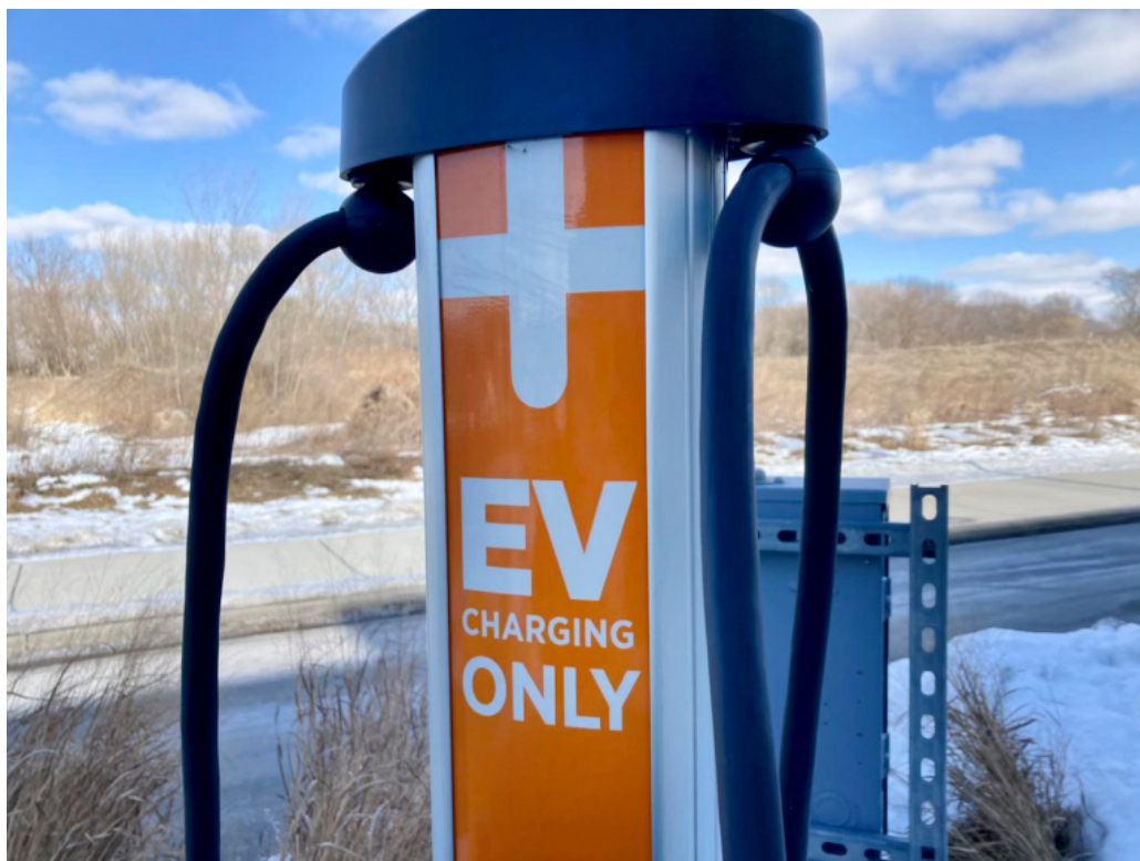
📷 A ChargePoint electric car charging station in a parking lot in Madison, Wis. on Feb. 12, 2022.

Yet during an Aug. 8 press conference, former GOP President Donald Trump falsely stated that if his Democratic rival, Vice President Kamala Harris, becomes president, everyone in the country will be forced to buy EVs.